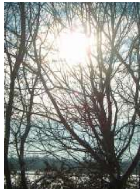
“The Miracle Of The Sun!”